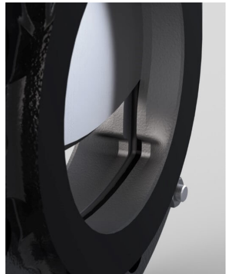
With its optimized gate geometry, accumulated media is pushed out of the gate guide and flushed out into the bore by the increased flow.