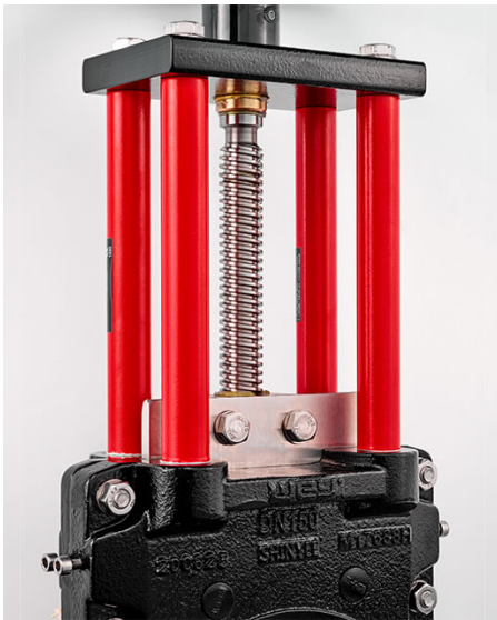
Robust 4-post topwork for maximum load and a wide variety of actuator types.