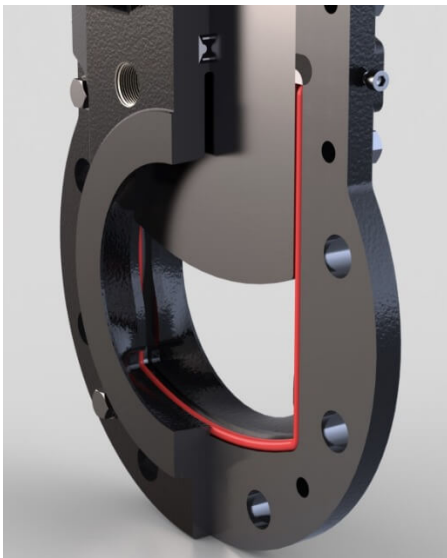
A mechanically retained round cord seal creates a bubble-tight shut off on the gate edge.