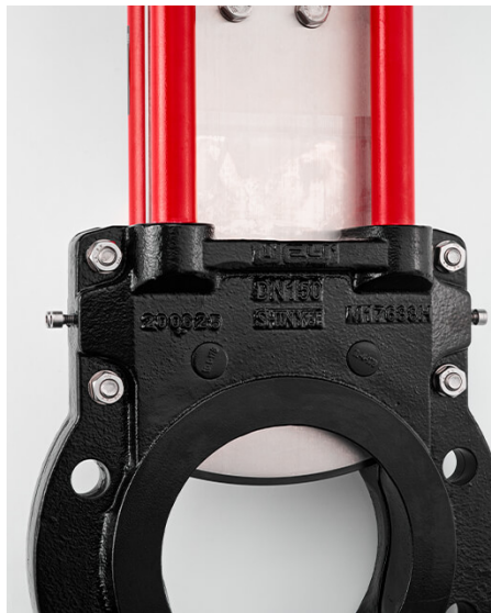
Optimized chest design to minimize the build-up of solids due to gate geometry.