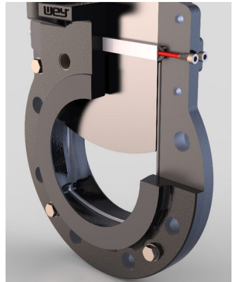
The transverse seal can be repacked at any time and under full pressure using the lateral packing screws.