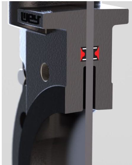
A unique transverse seal, consisting of a transverse seal profile and packing compound, makes the body bubble-tight towards the atmosphere.